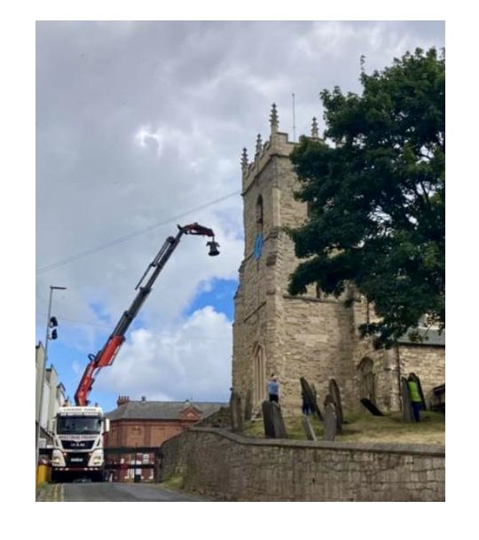
The team helping out