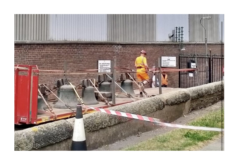
All the bells safely unloaded at the foundry