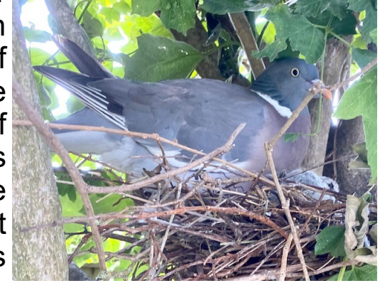
The squab is on the right of the nest under mum's beak.

blessed to have a loving Father who never leaves us and protects us as we go through life. We pray for safety but live in the hope of eternal life. Unlike the ducklings we are guided by knowledge and experience of dangers and pitfalls to try to steer ourselves safely through each day. But there are unseen perils and hazards which we cannot foretell so we need to trust in God, follow His ways, but prepare for life eternal.