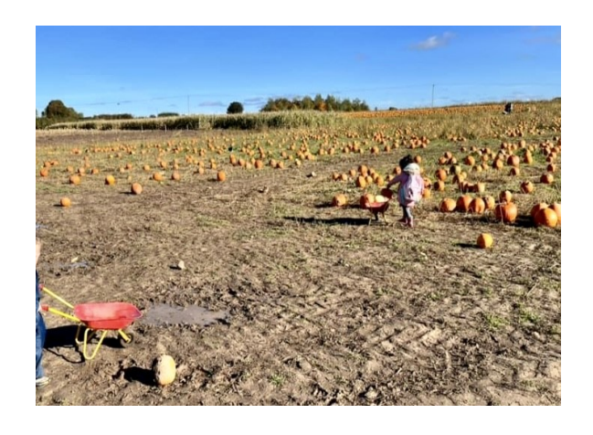
Tugboats had a great day pumpkin picking at Spillman's farm!