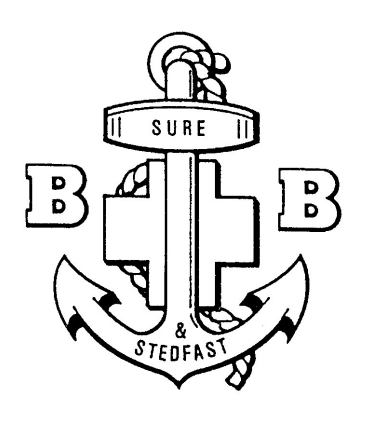
Squad Drill, Games and Crafts tonight at company \mathring{\mathbb{T}}