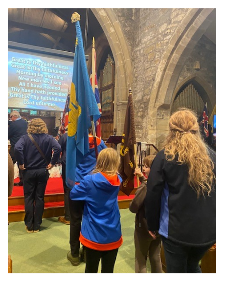
Church Parade of Boys Brigade, Guides and Brownie flags.