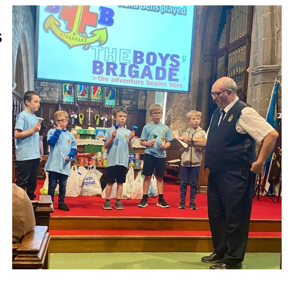
Mr B & Juniors perform 'We Plough the Fields and Scatter' on handbells