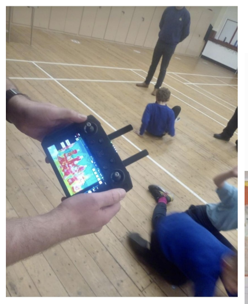
Our JUNIORS ALL THERMALISED UP