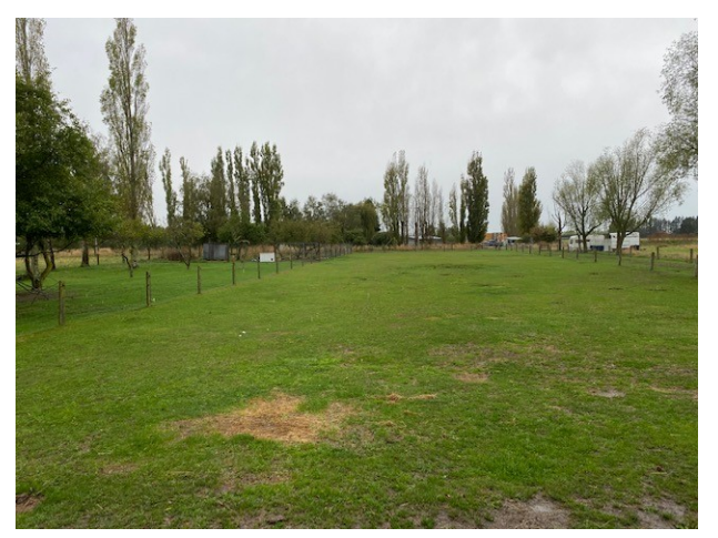
Damp enough for field mushrooms to sprout in the paddock!