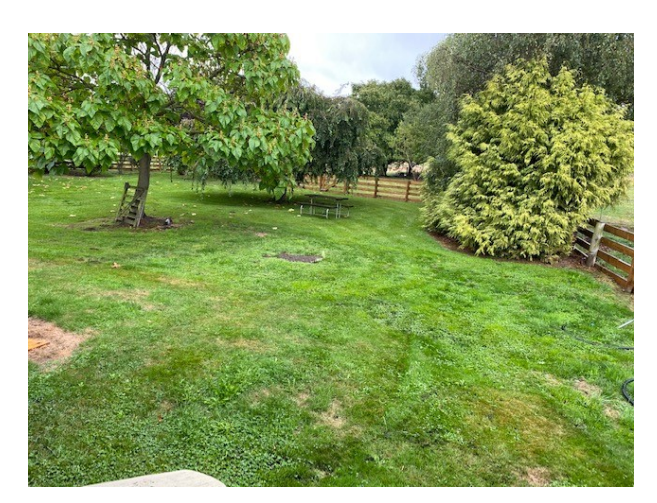
What a difference a few days rain made!

We went away for two weeks to visit my nephew, who lives three hundred kilometres away in the mountains. While away the coastal farming plain where my niece lives, had another couple of days of intense rain. When we arrived back there the fields were transformed – green and lush! So much grass had grown that the cattle and sheep were able to graze and feed supplements were at minimum.