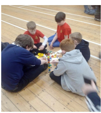
Building to reach for the stars with Company Lads