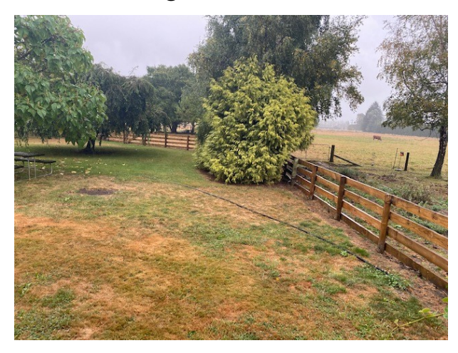
Green shoots appearing

Four days after our arrival a southerly wind blew in and brought heavy rain. It rained constantly for 24 hours. Within those 24 hours we saw small green shoots appear in the garden, the horses' paddock and the surrounding fields.