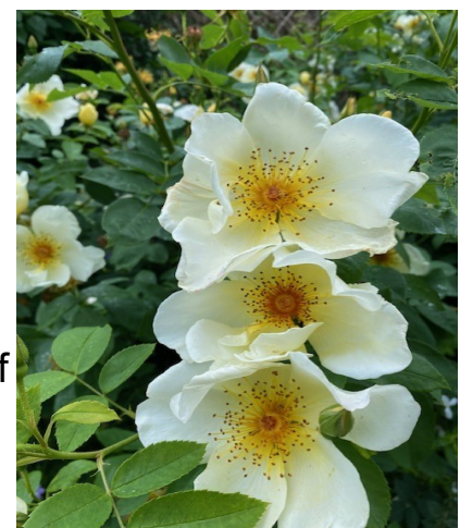
The beauty and perfume of old fashioned roses