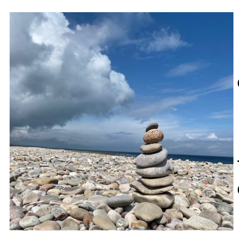
A stone sculpture against a dramatic sky

"God made us for joy. God is joy, and the joy of living reflects the original joy that God felt in creating us."