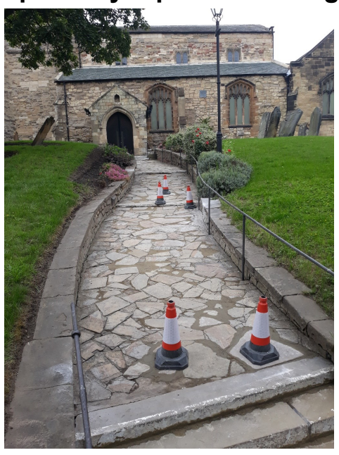
The church pathway repointed during lockdown