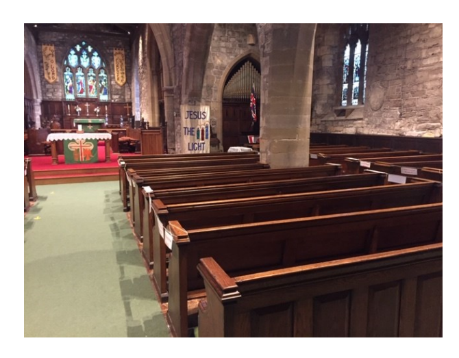
Tape has gone and notices show you where to sit