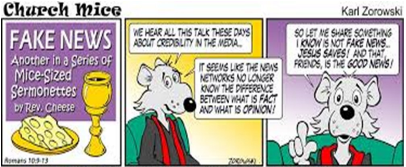
Visit us online at www.churcherioe.net.