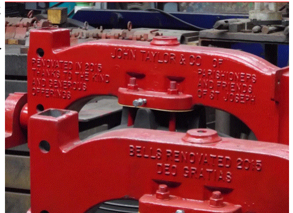
Example of sponsored bell with dedication