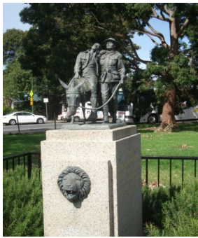
National Shrine of Remembrance Melbourne

Melbourne , the National War Memorial in Canberra and with some interesting tree sculptures on the promenade at Lakes Entrance in Southern Victoria and also a statue in King Street South Shields.