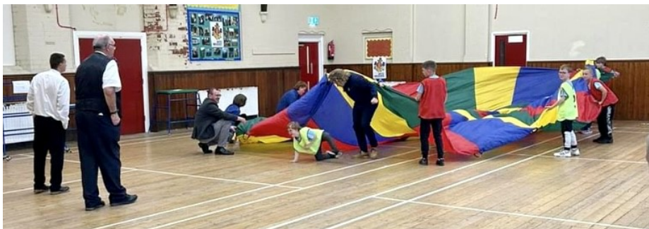
Fun with the parachute