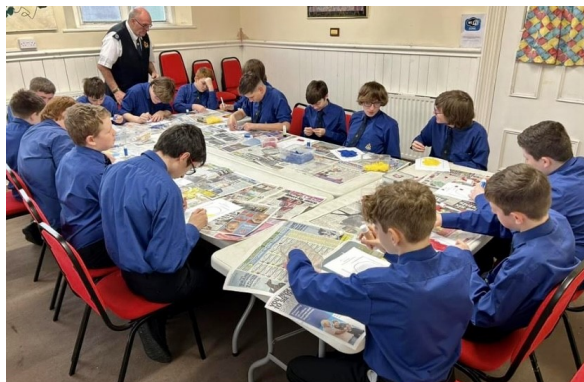
Profiles of HM The King by the Company Lads