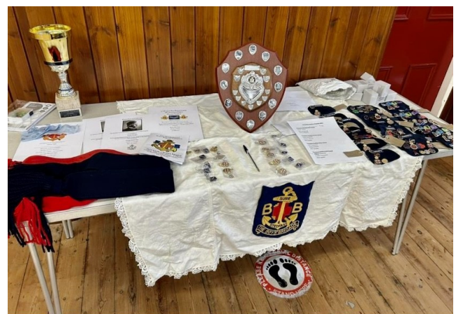
Our Company memorabilia and awards table